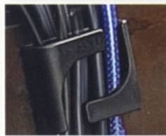
WIRE MANAGEMENT CLIP