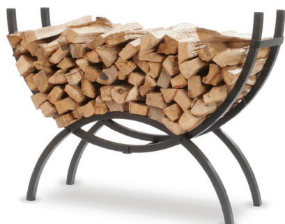
1.25" Square Tube; Holds 1/5 Cord of Wood