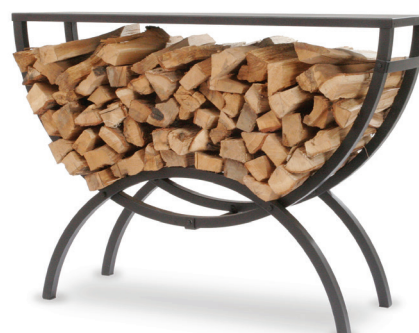
SCRM with SCRM-T