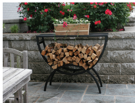
SCRM with SCRM-T