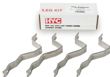
SSLK - Leg Kit