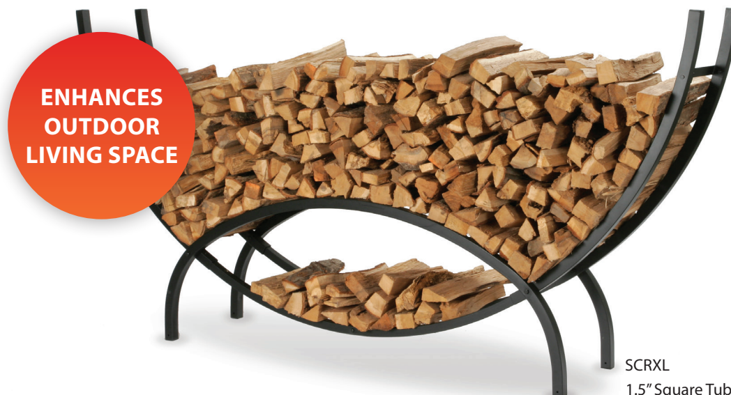
SCRXL 1.5" Square Tube; Holds 1/3 Cord of Wood