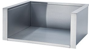
Stainless Grill Sleeves (Dimensions in inches)

BSASL26 25 3/4 W x 22 3/4 D x 12 3/4 H BSASL34 33 3/4 W x 22 3/4 D x 12 3/4 H BSASL42 41 3/4 W x 22 3/4 D x 12 3/4 H